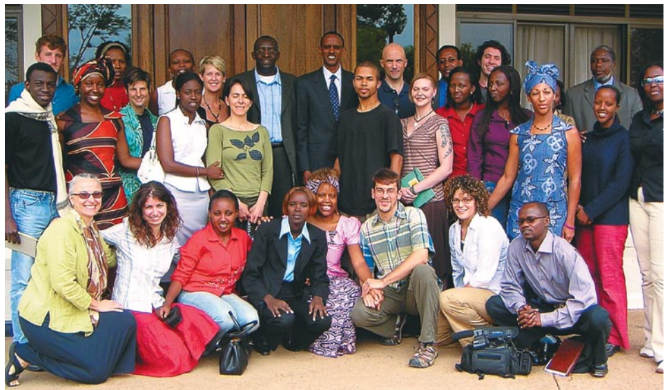
Clockwise from top left, waiting at the Uganda/Rwanda border; at a trial in the gacaca court; workshop members with President Kagame, center with tie, in 2006.

In seeing in this way, by deliberately committing to a new perspective, we allow ourselves to be shaped by the event—to be created by it.