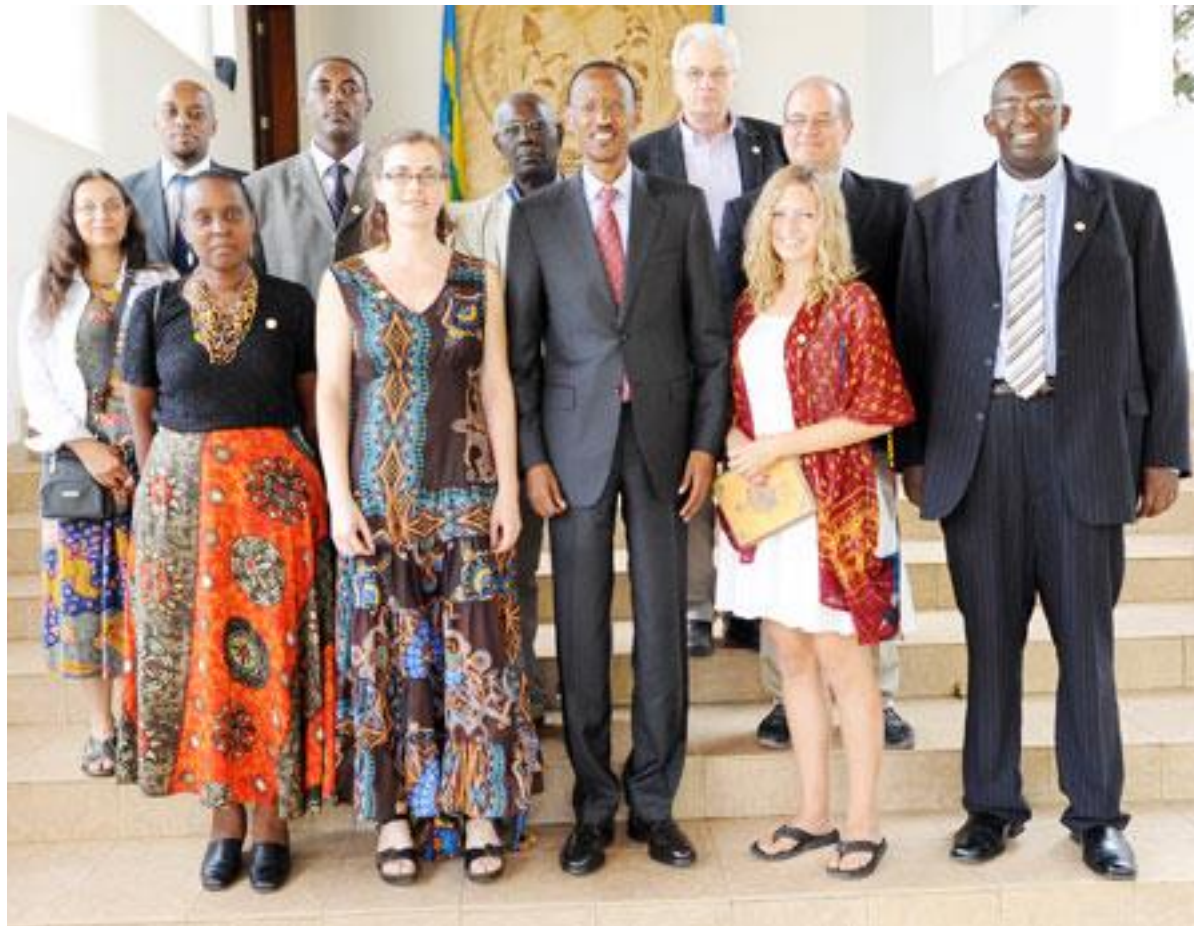
Researchers with President Kagame, 2011