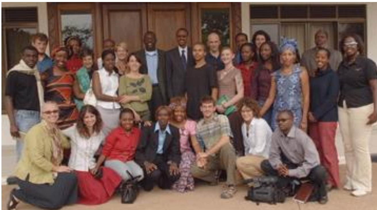
IGSC students with President Kagame, 2006